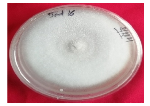
Fig. 2a. Pure culture of pathogen.

Isolation, purification and maintenance. The infected samples were excised, cut into pieces around 3 and 4 millimeters and surface sterilized with MgCl<sub>2</sub> (0.1 %). Under completely sterile and aseptic conditions, the excised pieces were distributed evenly over potato dextrose agar media in each petri dish. In a BOD incubator, plates were incubated at 25\pm2^{\circ} C. Purified cultures were obtained, and the related fungus was identified through microscopic examination. Fusarium spp. isolates were purified using the single spore culture method and replicated on potato dextrose agar for additional research.