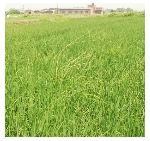
Fig. 1. Symptoms of bakanae disease in rice field.

pathogen and complexity of morphological identification, there is a need for developing a rapid detection assay for management of bakanae. Hence keeping all this in view, current investigation was carried out to assess the efficiency of PCR analysis of the Tef -1 gene for identification of different isolates.